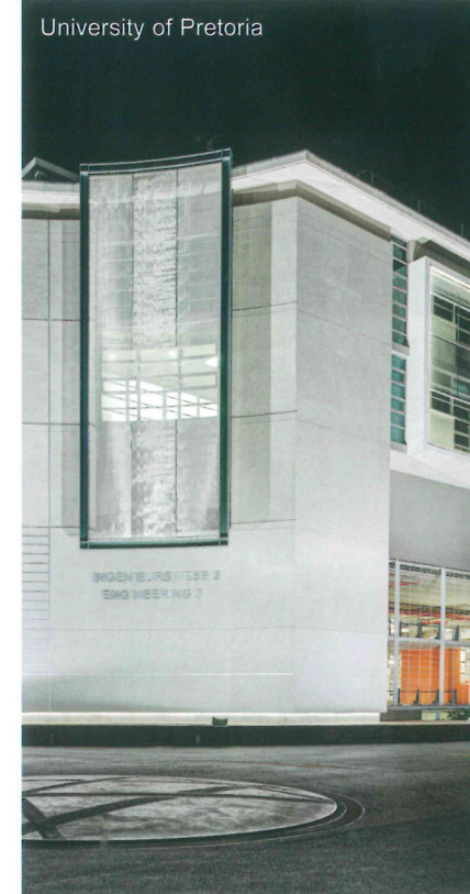
University of Pretoria

SilverCare is another firm favourite. It is a long-lasting protection system, with a base