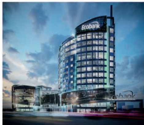
Ecobank, Accra, Ghana