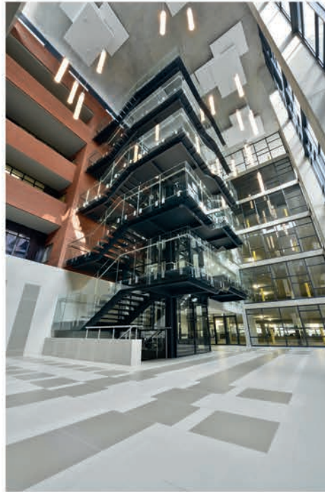
66 Grayston, Sandton