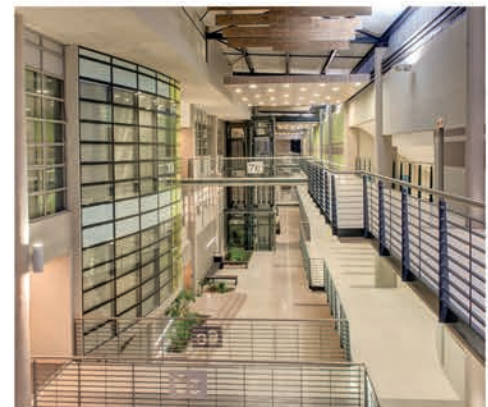
Engineering 3, University of Pretoria