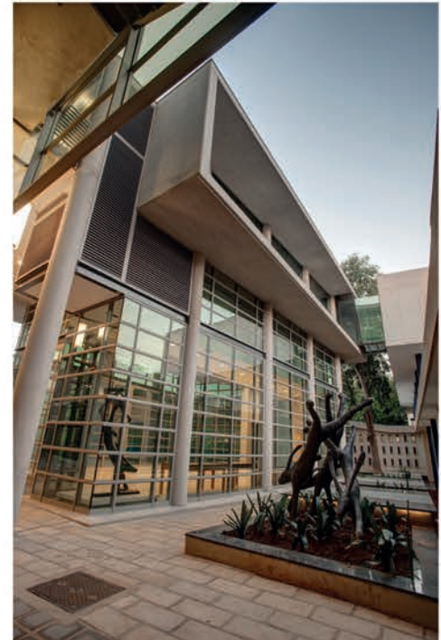
Musaion, University of Pretoria