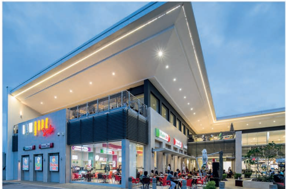
West Hills Mall, Accra, Ghana